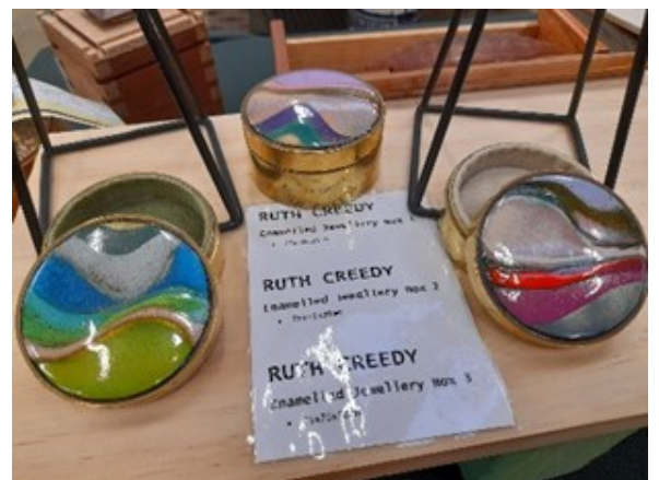
Ruth Creedy recently made these stunning enameled jewellery boxes which were on display at last month's Open Day

Tune into current and past episodes of The Shed Wireless at mensshed.org/theshedwireless