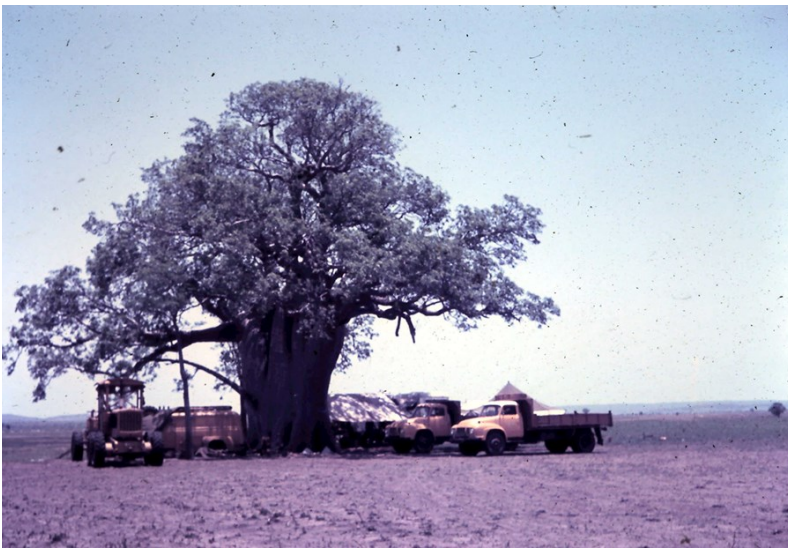
Bullo River camp—1962

In 1970 it was decided that they move back to Adelaide where Bruce was to take over the maintenance of the Fire Station at Adelaide airport, very similar to Darwin, but no jet boat.